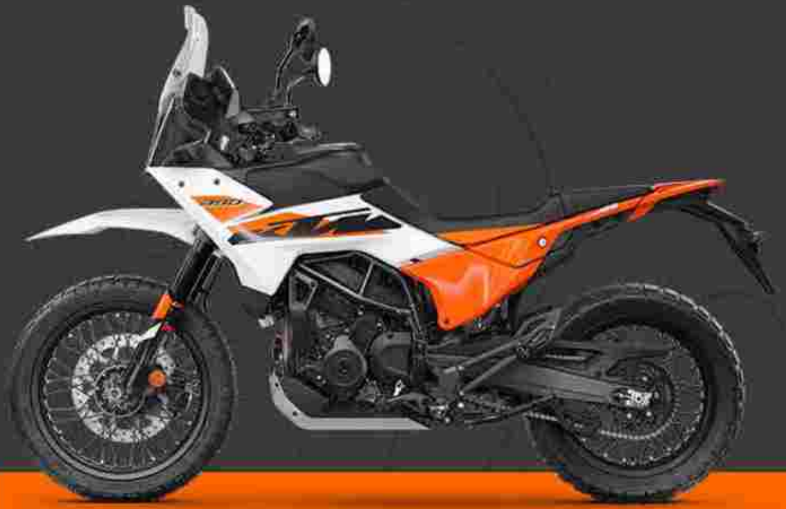
KTM 390 ADVENTURE Ceramic White