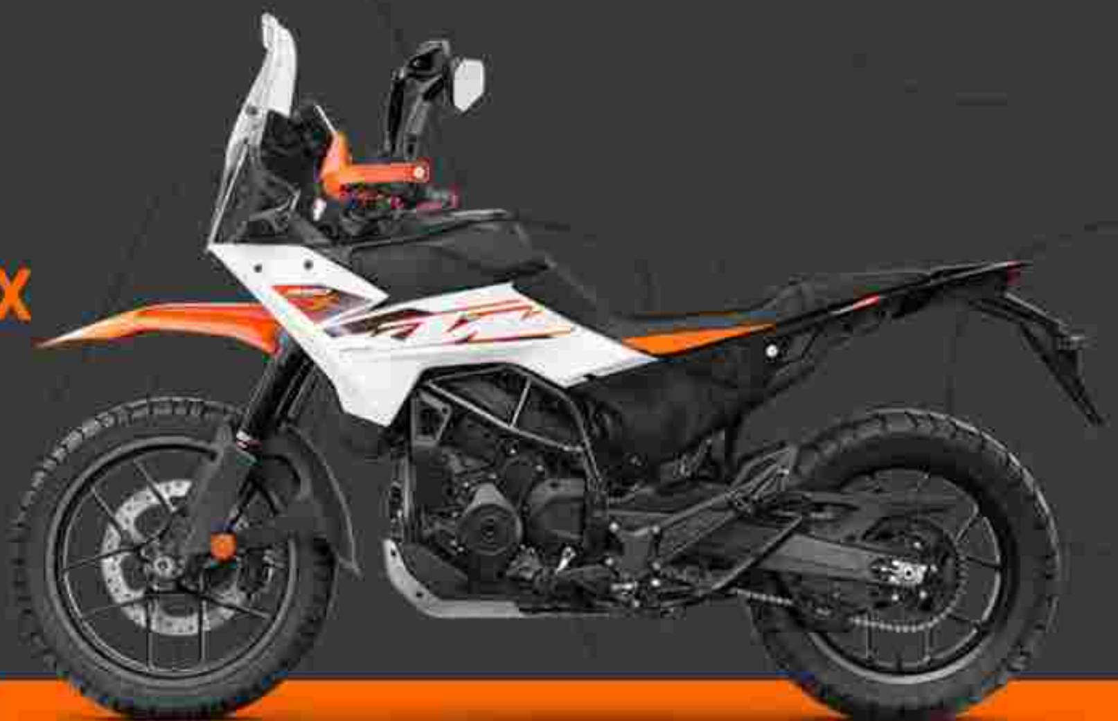
KTM 390 ADVENTURE X Ceramic White