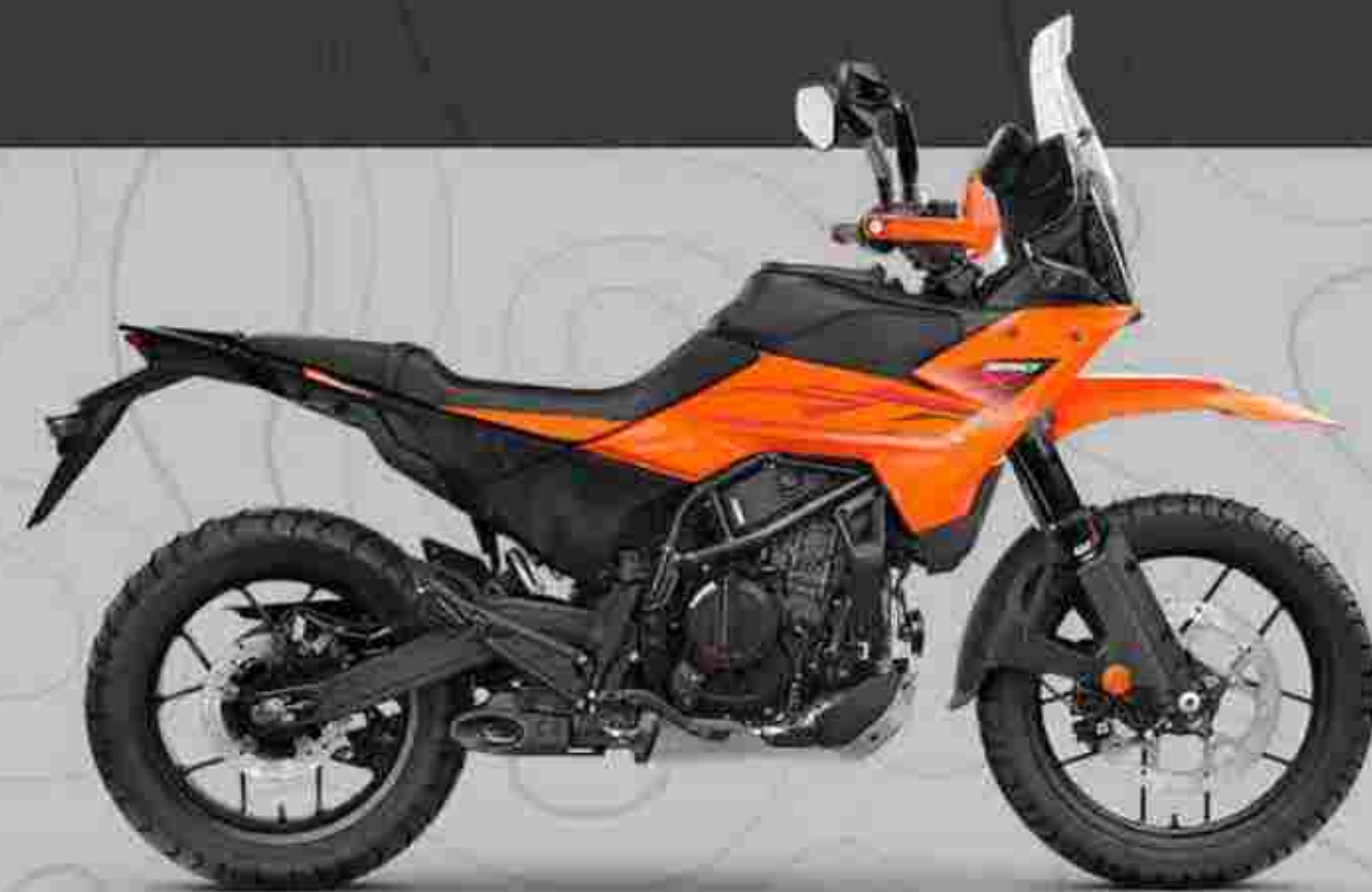
KTM 390 ADVENTURE X Electronic Orange