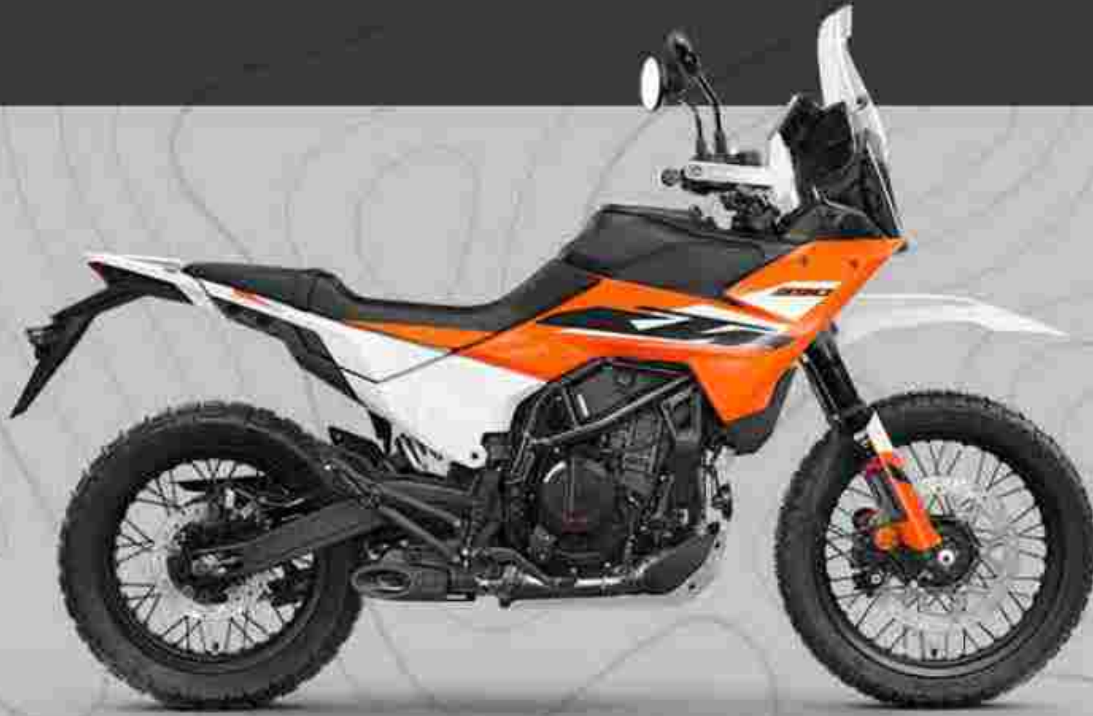
KTM 390 ADVENTURE Electronic Orange